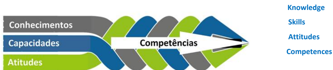
Picture 2: Competence Conceptual Framework (Adapted from: Progress report on the Draft OECD EDUCATION 2030 Conceptual Framework - 3rd Informal Working Group (IWG) on the Future of Education and Skills: OECD Education 2030)

Competences are complex combinations of knowledge, skills and attitudes, they are vital for the students' profile, as well as for compulsory schooling. Picture 2 illustrates this concept emphasising the interconnection of the three dimensions.